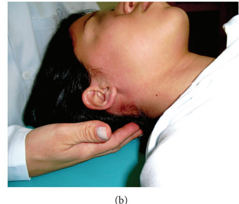
Figure 1: Physiotherapist's hand position during the procedure. (a) CV-4 technique, (b) placebo technique.

Fourth ventricle compression (CV-4) is a cranial manipulation technique aiming at influencing on brain and cranial nerve function [19]. Some authors have suggested that CV-4 may produce changes in the regulation of the autonomic nervous system (ANS). For instance, Cutler et al. [20] reported muscle sympathetic nerve activity after applying the CV-4 technique. The use of CV-4 technique has also been purported to modify heart rate, blood pressure, blood flow velocity [21, 22], and cerebral tissue oxygenation [23]. Moreover, CV-4 has been observed to produce an increment of electroencephalography alpha absolute power [19], reduce sleep latency [20], and decrease anxiety [21] in healthy subjects. In addition, CV-4 has been shown to be effective in pain relief in tension type headaches [24]. Due to the established interactions between the autonomic and nociceptive systems, the potential effects of CV-4 on the autonomic regulation could represent a novel approach to control the development or maintenance of pain. Nevertheless, the physiological mechanisms undergoing CV-4 autonomic regulation remain unclear. The aim of the present study was to assess the immediate effects of the CV-4 technique compared to sham placebo intervention in plasma catecholamine levels, heart rate, and blood pressure on healthy adults.